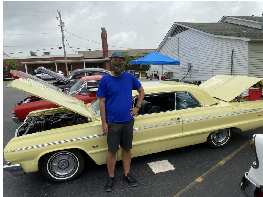
Oaklawn United Methodist 2020 Car Show