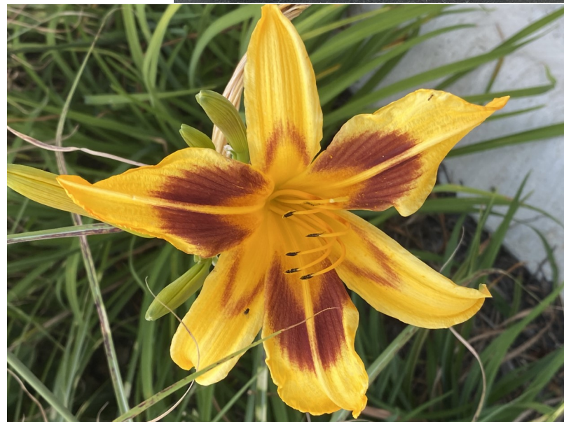
Such a beautiful flower outside of our Family Life Center.