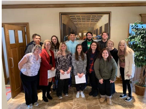
Youth - Left