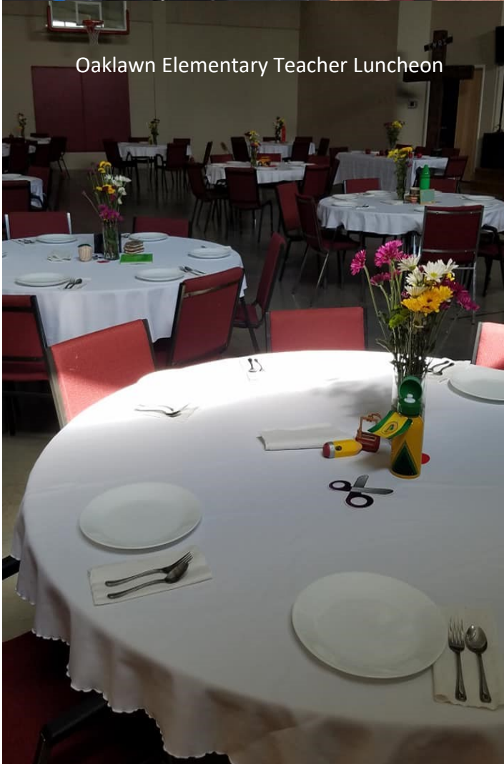
Oaklawn Elementary Teacher Luncheon